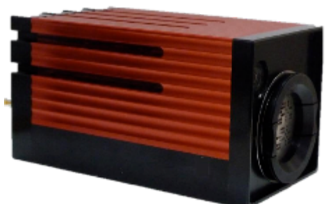
Figure: the camera head unit

The next-generation gamma imaging system, the gamma camera (See Figure), utilizes a Timepix sensor and coded mask to localize gamma radiation within its field-of-view without the use of heavy shielding or bulky detectors. The